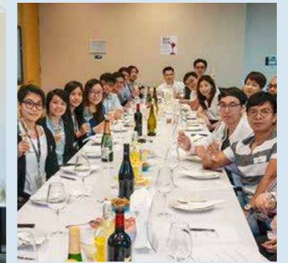
Wine Tasting Workshop