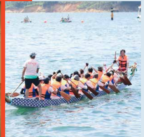
Dragon Boat Race