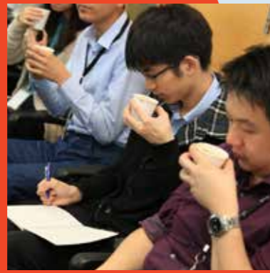
Coffee Tasting Workshop