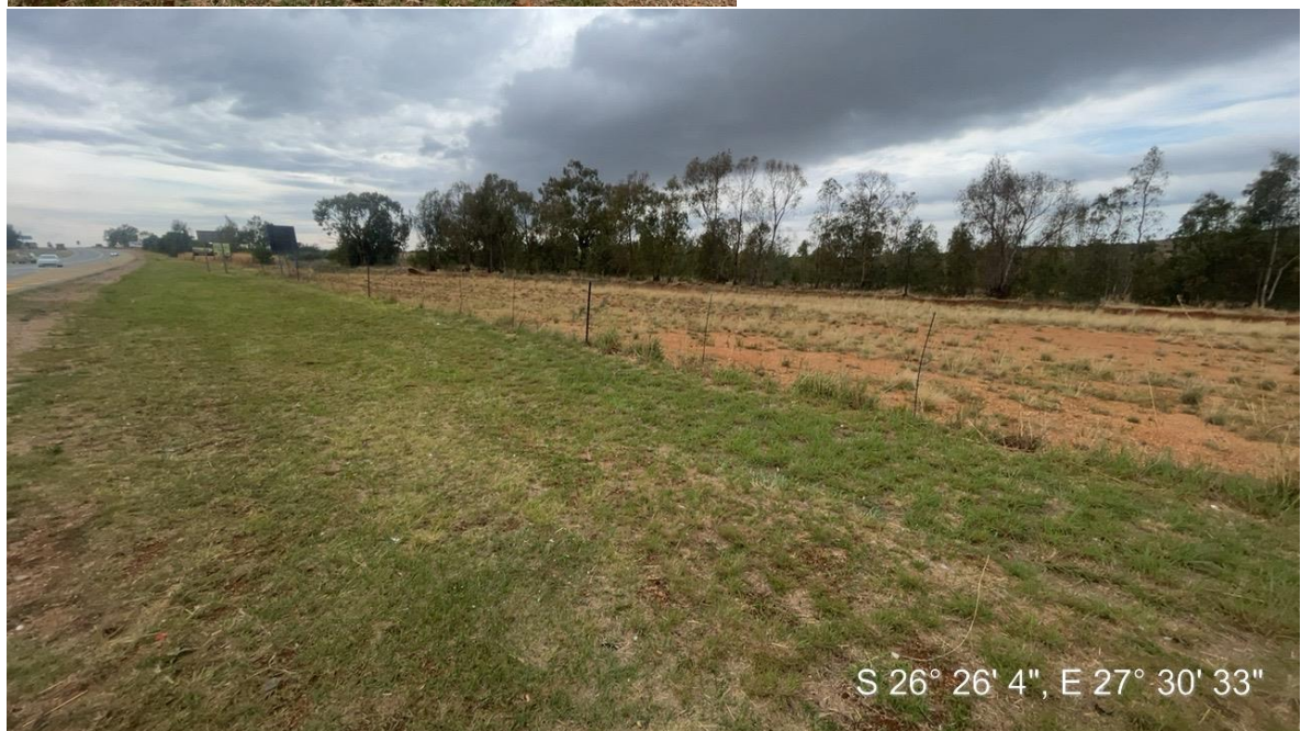
Photo illustrating the study area looking South East