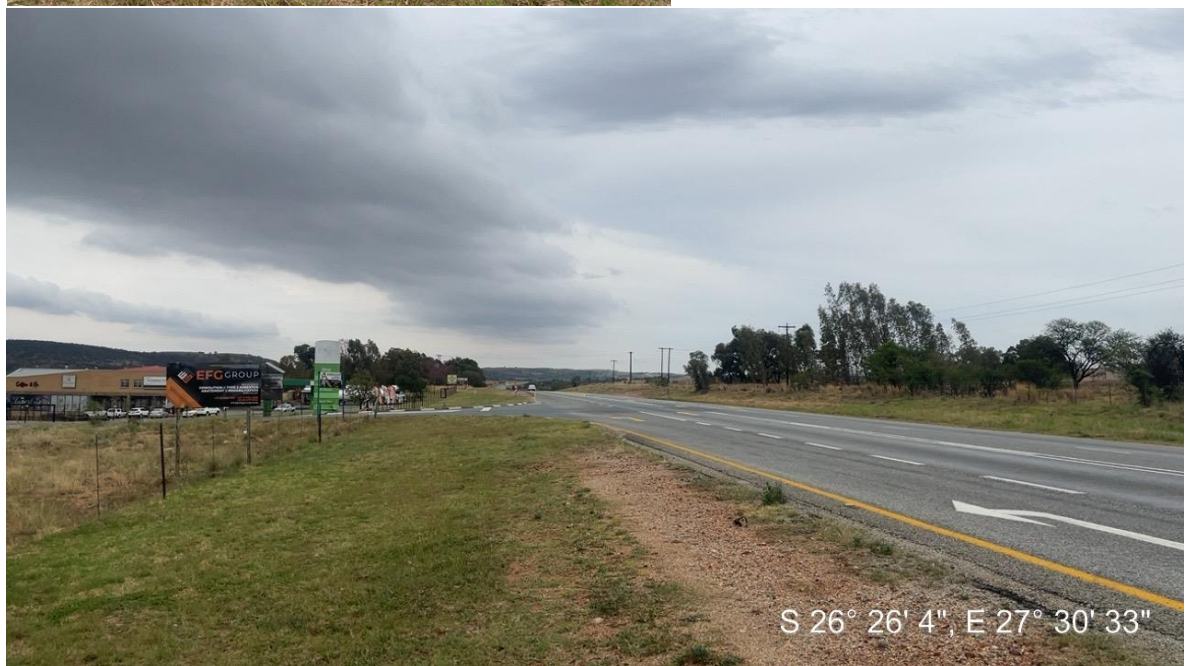
Photo illustrating the study area looking South West