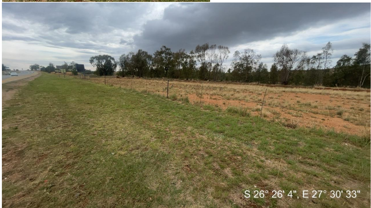
Photo illustrating the study area looking South