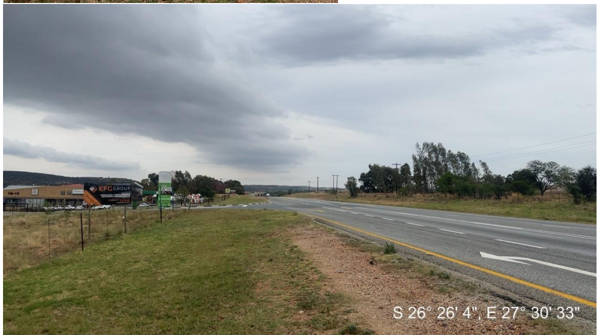
Photo illustrating the study area looking North West