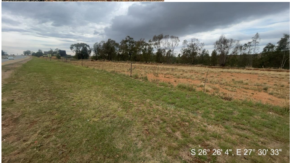
Photo illustrating the study area looking East