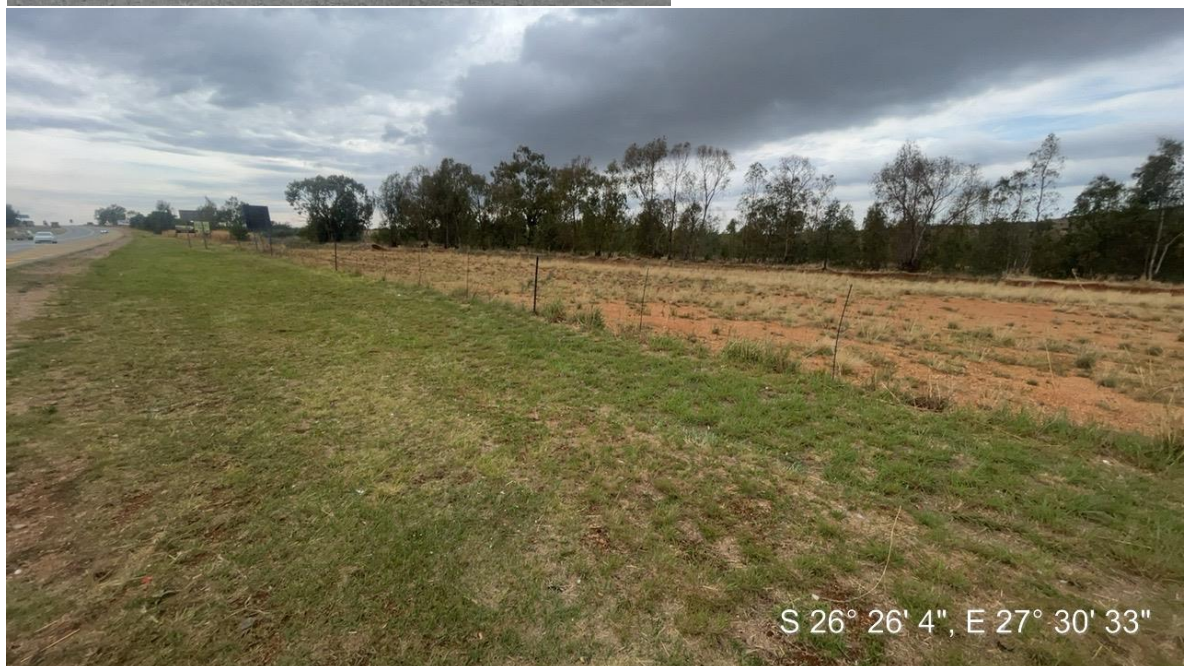
Photo illustrating the study area looking North-east