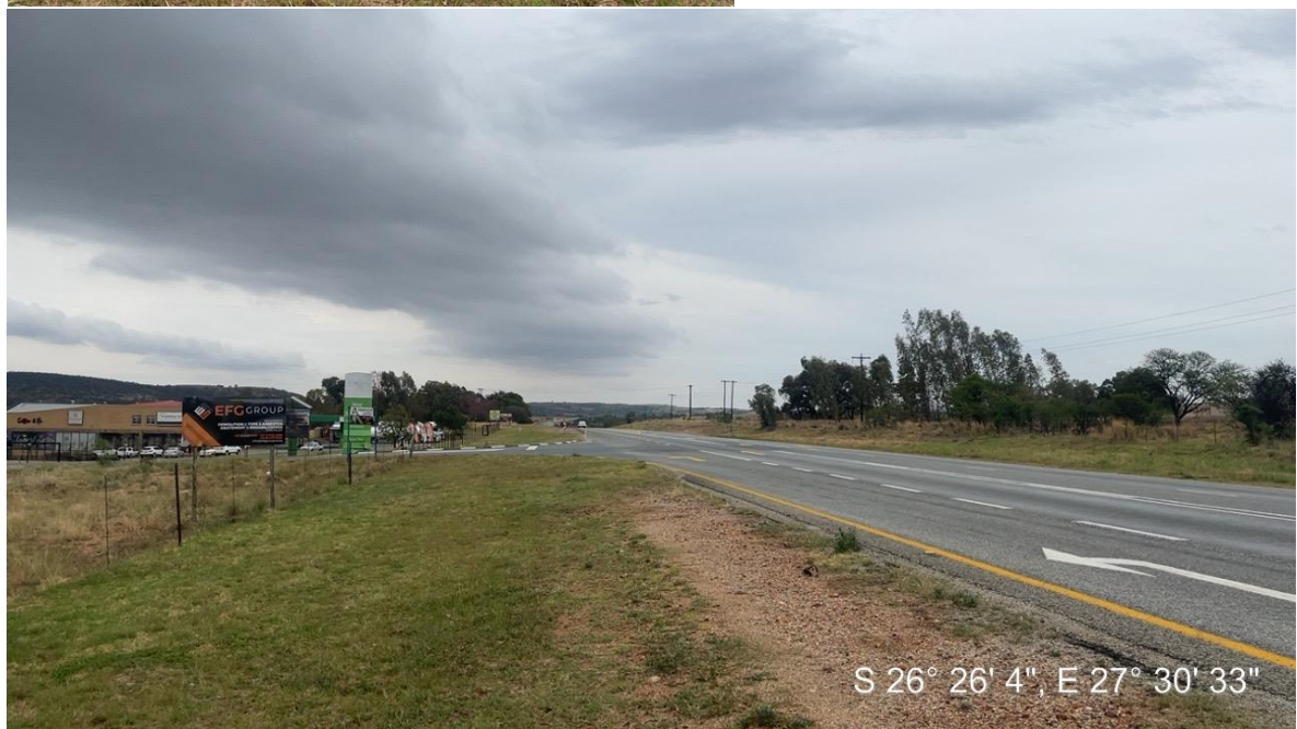
Photo illustrating the study area looking West